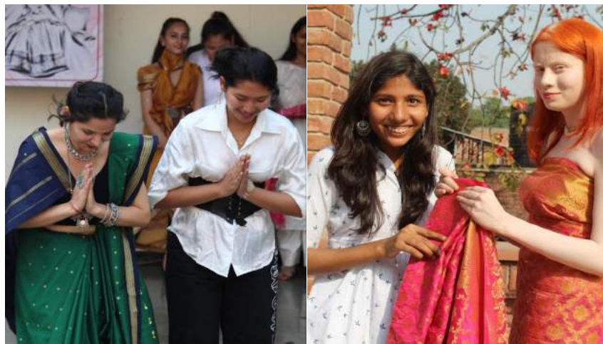
Styling contest with Tale of a Trend & Zoom Delhi