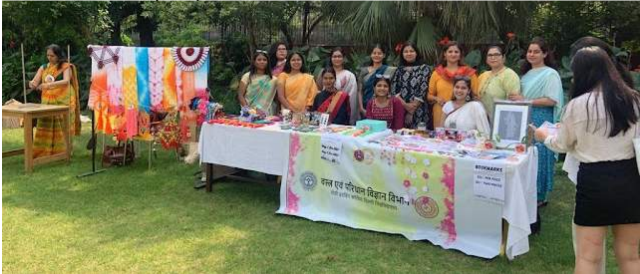
Diwali kiosk 17.10.23