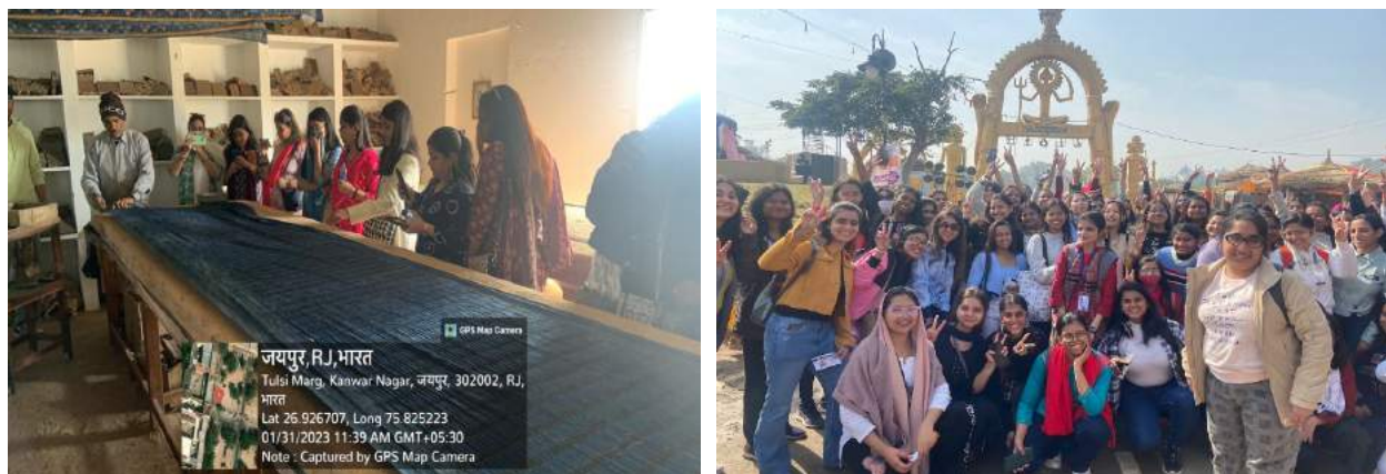
Visits to Jaipur and Surajkund